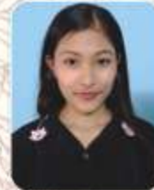
Tinkumoni Sonowal Nemcare Hospital, Guwahati (Neuro ICU)