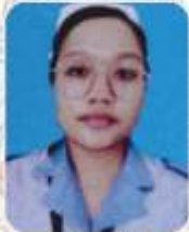
Vanlahini Nemcare Hospital, Guwahati (Ward)