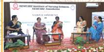
Panel Discussion on Translating Advancing Emergency Care Research to Everyday Practice