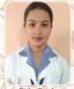
Disha Boseh Dhruvati Ambhoni Hospital, Bhakhri (Medical-Surgical ward)