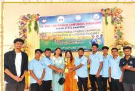
Boy's Volleyball Team won 1 st prize at the 41 st SNA-TNAI Biennial National Conference