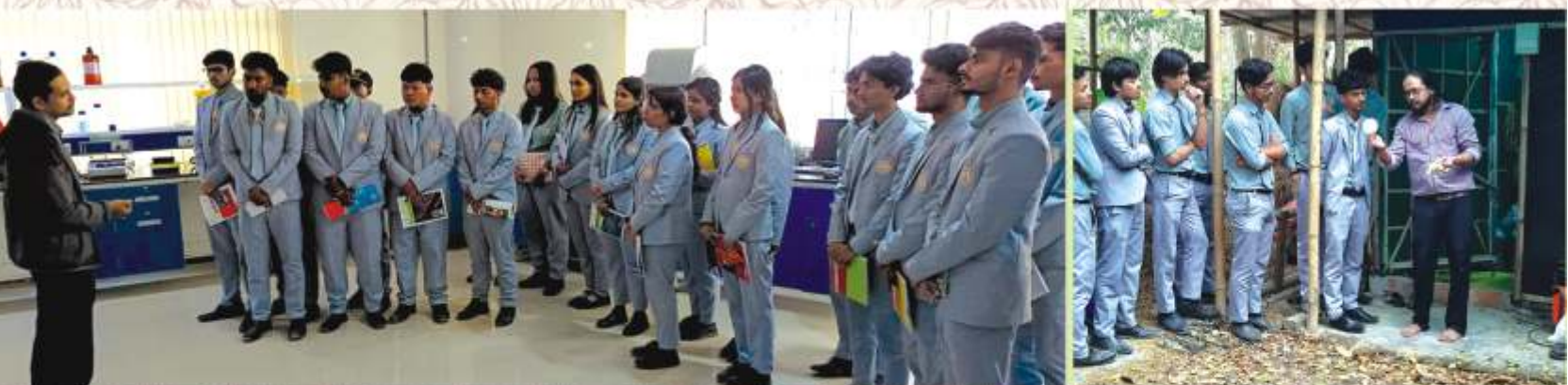
Different training programs organized for the students of Department of Biotechnology, NGI