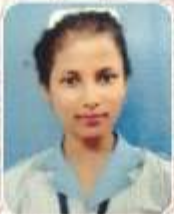
Endorbanyllawnehmong Nemcare Hospital, Guwahati (NICU)