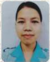
Rikmenlang Thongni Nemcare Hospital, Guwahati (OT)