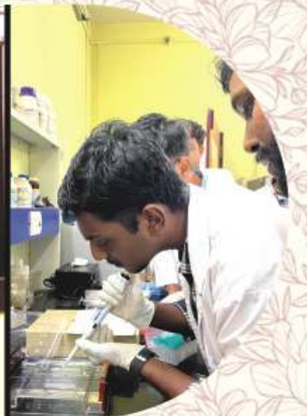
B.Sc. Biotechnology 3 rd Semester students performed Hands-on Training Programme in Basic Molecular Tools Organized at Dept. of Biotechnology, Gauhati University.