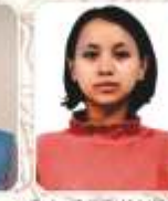
Nivedita Nemcare Hospital, Guwahati (MICU)