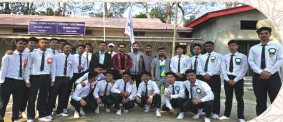
NGI students won 2 nd Prize in March Past Republic Day Parade organised by Palaabari Co-District Administration