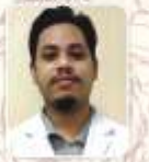
Kangkim Boro GMCH