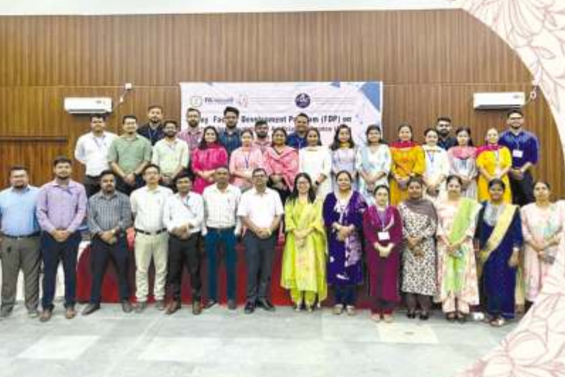
Faculty Development Program (FDP) on Strategic Implementation of Artificial Intelligence (AI) in Modern Scientific Education System as per National Education Policy 2020