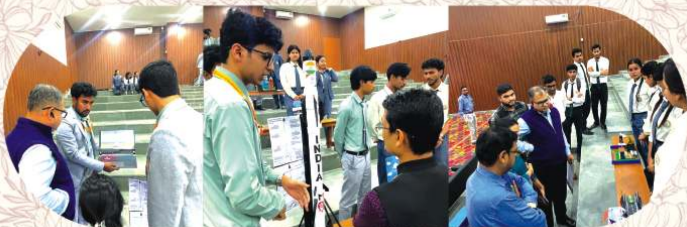
Celebration of National Science Day at NGI by the Department of Biotechnology & Food FND.