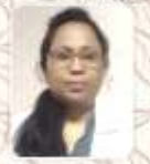
Sumita Mili Supercare Hospital Shillong