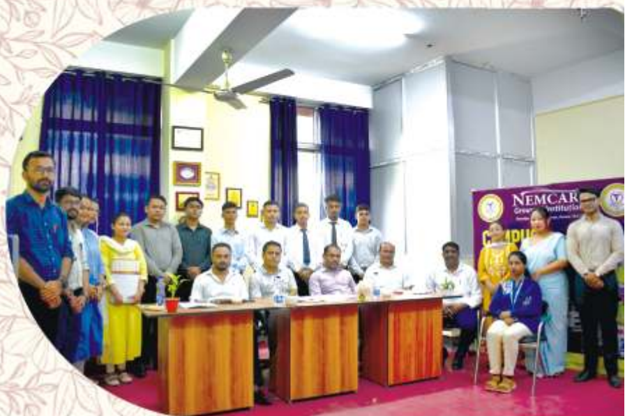
Campus Placement Drive conducted by Hetero Healthcare Limited on 24th June 2025 at NEMCARE Group of Institutions Mirza Assam