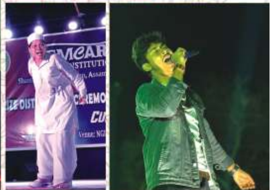
NEMFEST 2026 Cultural Night