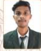
Tapash Sarma Production Ajanta Pharma