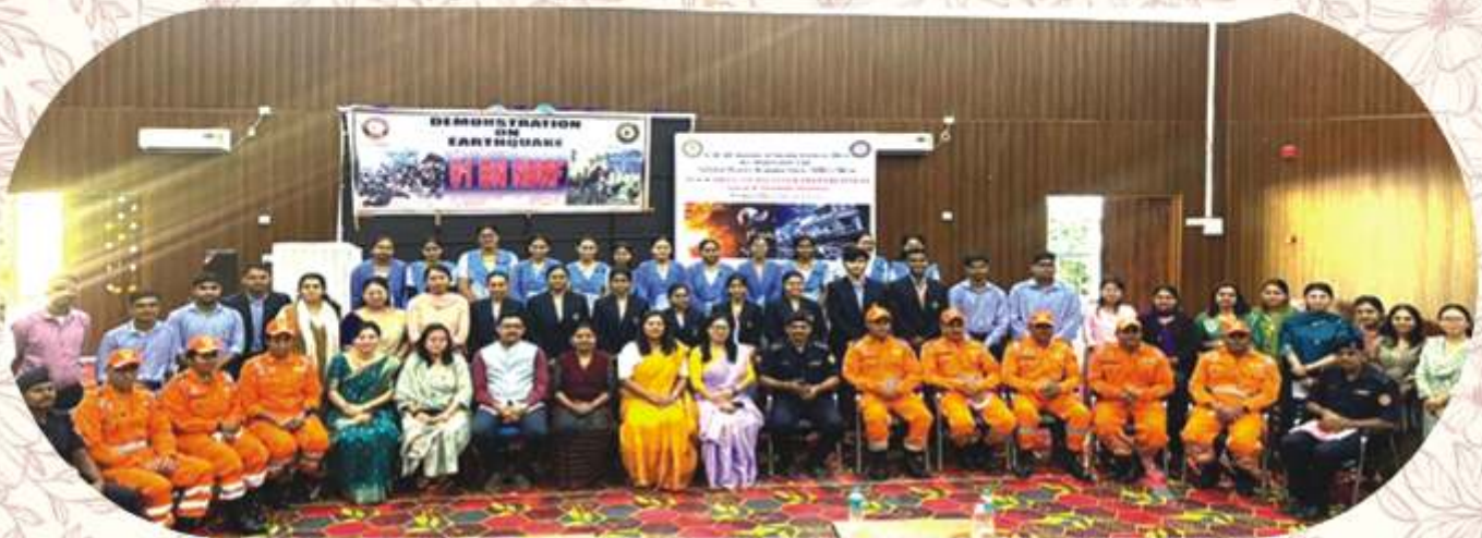
Mock Drill on Natural Disaster Preparedness organized at NGI Auditorium