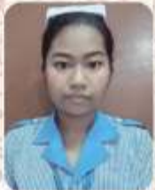
Shriya Hojai Nemcare Hospital, Guwahati (Neuro ICU)