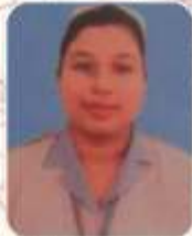
Bhupali Saharia Nemcare Hospital, Guwahati (Cath Lab)