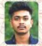
Pallab Jyoti Deka Morigaon Civil Hospital