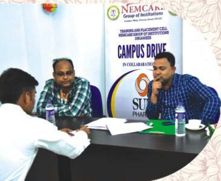
Campus Drive of Sunpharma, Guwahati