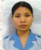
Yophika Thabeh Nemcare Hospital, Guwahati (Burn unit)