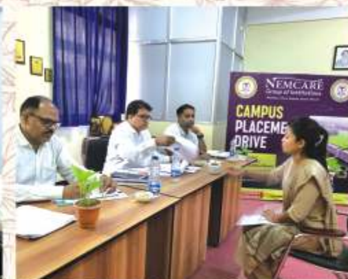
Campus Placement Drive conducted by Ajanta Pharma Limited on 6th June 2025 at NEMCARE Group of Institutions Mirza Assam