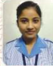
Ponam Das Nemcare Hospital, Guwahati (Neuro ICU)