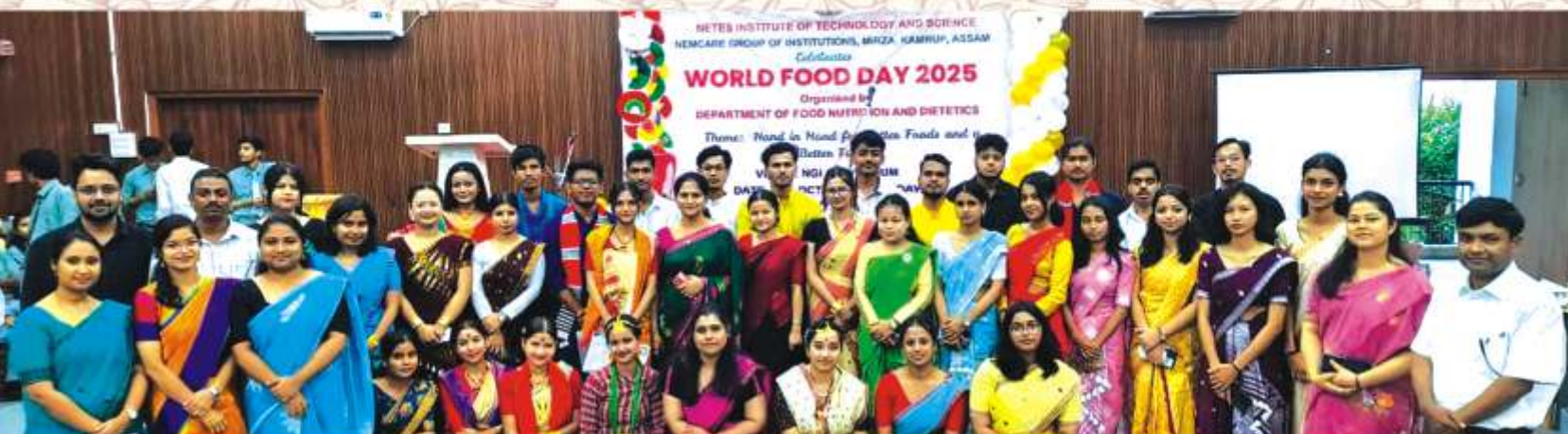
Celebration of World Food Day at NGI by the Department of Food Nutrition and Dietetics.