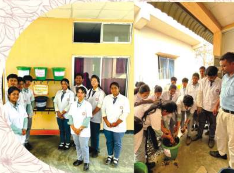
Vermicompost Production Unit at NGI. Students of Department of Biotechnology & FND producing Vermicompost from Organic Waste.