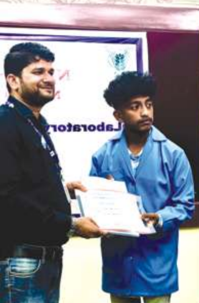
B.Sc. Biotechnology 3 rd Semester students performed Hands-on Training Programme in laboratory techniques for genome editing workflow in animals organized by ICAR-National Research Centre on Pig.