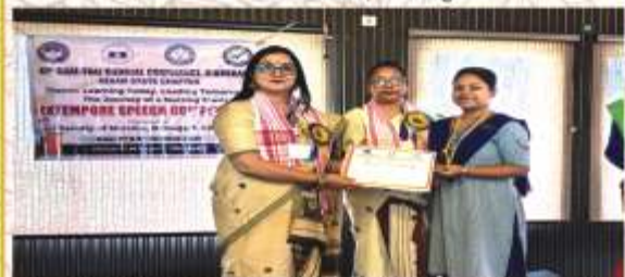
Our Student Won 3 rd Prize in Scientific Paper Presentation