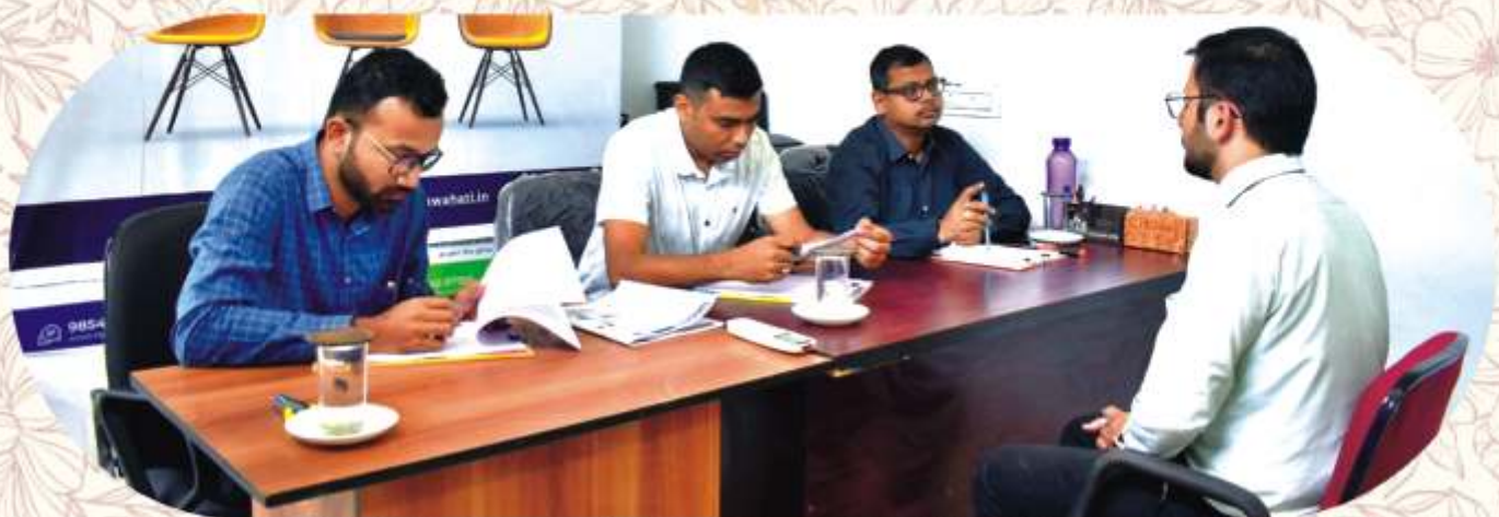
The Training and Placement Cell, NGI conducted Simulated Interview 2.0 as a part of the grooming session