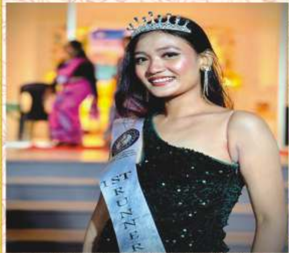
Ms. SNA 1 st Runner - Up at 41 st SNAI-TNAI Biennial Conference, Dibrugarh