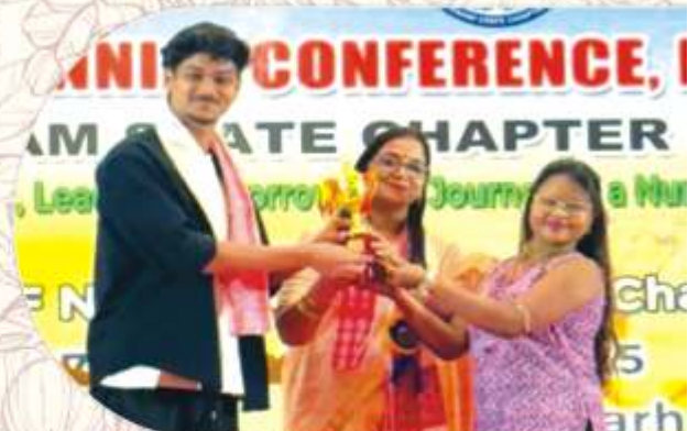
Best SNA Unit of Assam, 2025 : NINS has been awarded Best SNA Unit of Assam- a recognition of our students' devotion, teamwork and excellence.