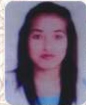
Munmi Kalita Nemcare Hospital, Guwahati (Emergency)