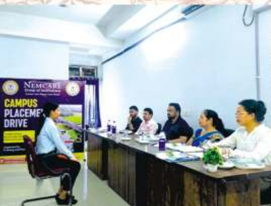
Campus Placement Drive of MHA students at NEMCARE Group of Institutions, Shantipur Mirza Assam