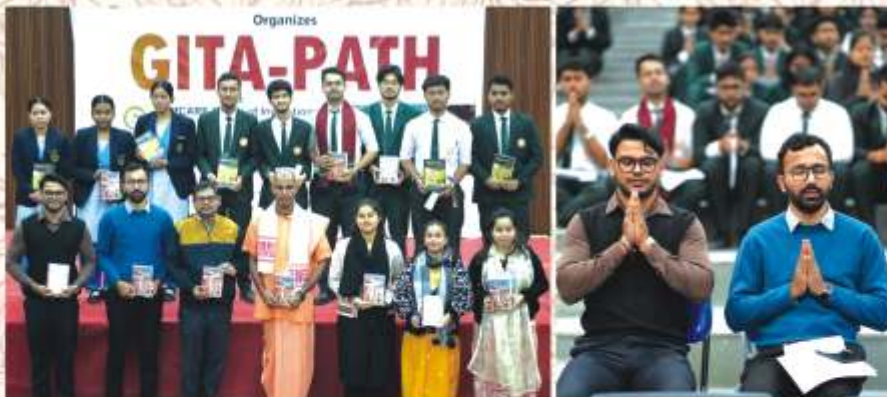
GITA-PATH at NEMCARE Group of Institutions, Mirza Assam on 19th December 2025 in association with HARE KRISHNA MANDIR, North Guwahati