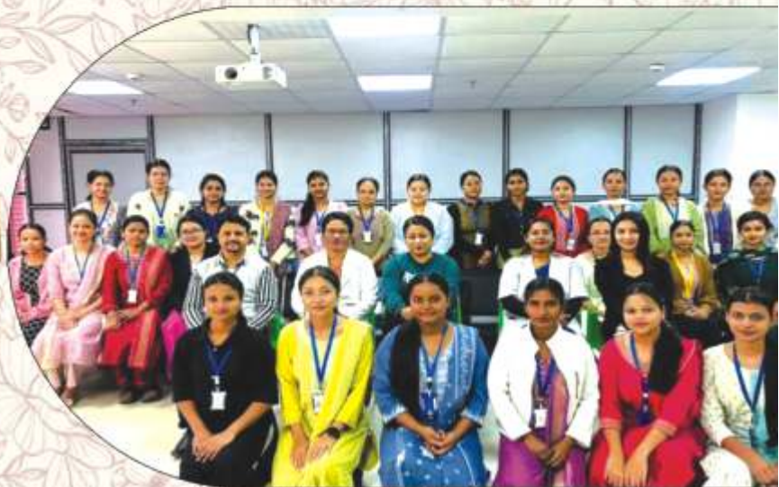
Placement Drive for Final Year GNM Students at Nemcare Super Speciality Hospital, Guwahati