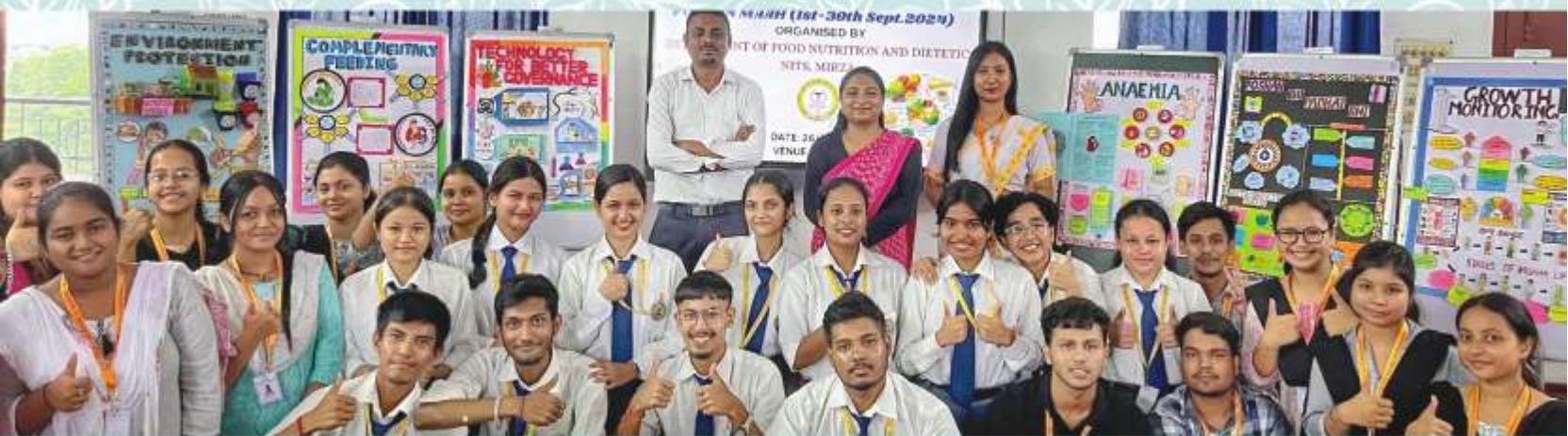
Celebration of Nutrition Month at NGI by the Department of Food Nutrition and Dietetics.