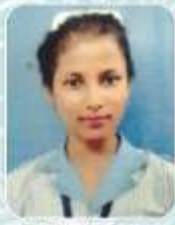
Endorbanyllawunshong Nemcare Hospital, Guwahati (NICU)