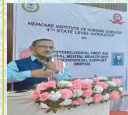
4 th State Level Workshop on Psychological First Aid (PFA), Mental Health and Psychosocial Support (MHPSS) Conducted on 26 th November 2024