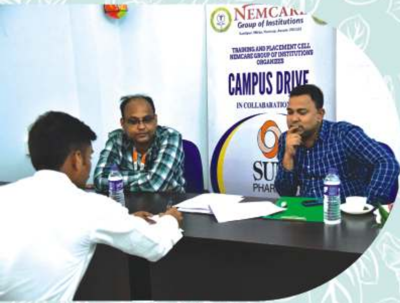
Campus Drive of Sunpharma, Guwahati