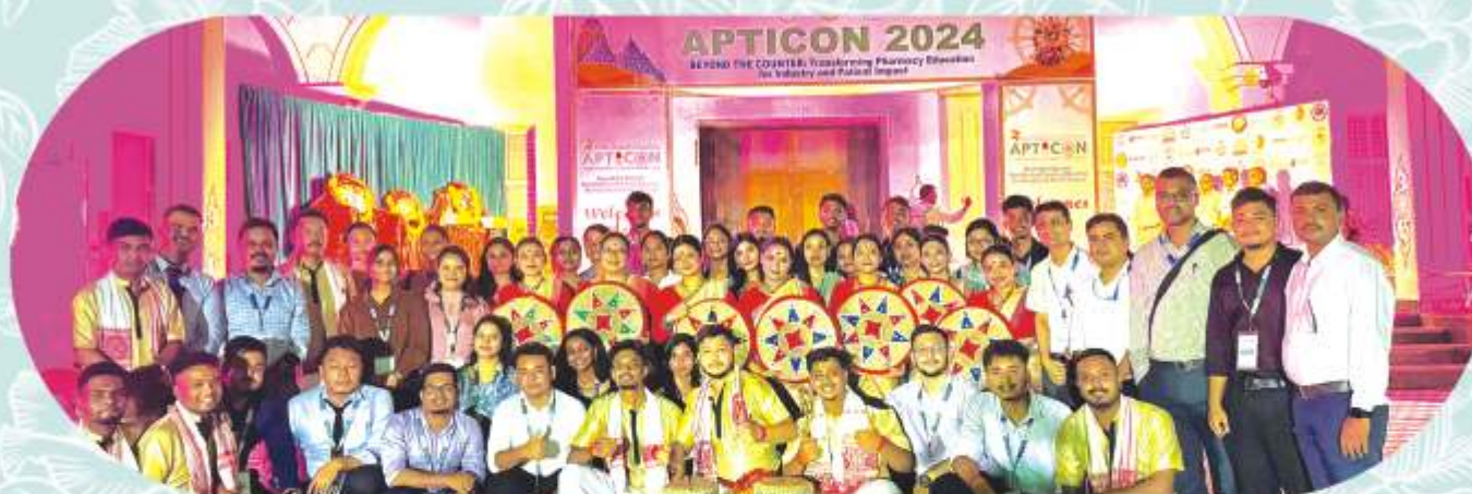
NGI representing the State of Assam at 27 th Annual National Convention of APTICON held at Utkal University, Odisha on 27 th & 28 th September, 2024.