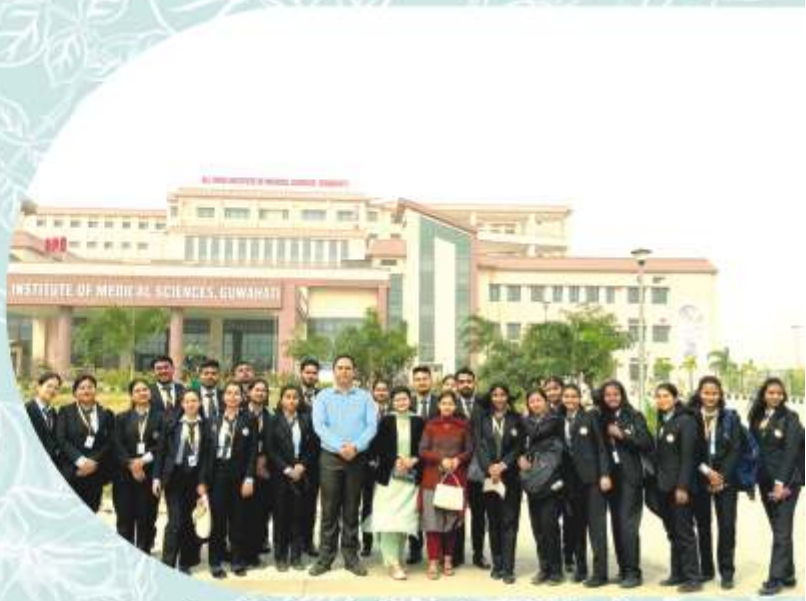
Educational field trip/ Training visit by the students of Masters in Hospital Administration 2 nd Semester at AIIMS, Guwahati.