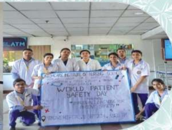
Group activities on world patient safety at NEMCARE Hospital, Bhangagarh