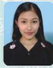
Tinkumoni Sonowal Nemcare Hospital, Guwahati (Neuro ICU)