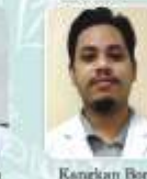
Rangdon Boro GMCH