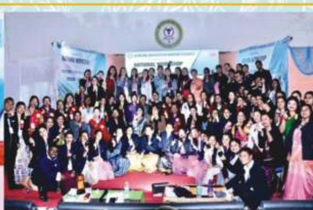
NATIONAL WORKSHOP ON OSCE/OSPE: COMPETENCY TRAINING ON 4 TH & 5 TH JANUARY, 2024