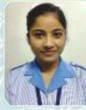
Ponam Das Nemcare Hospital, Guwahati (Neuro ICU)