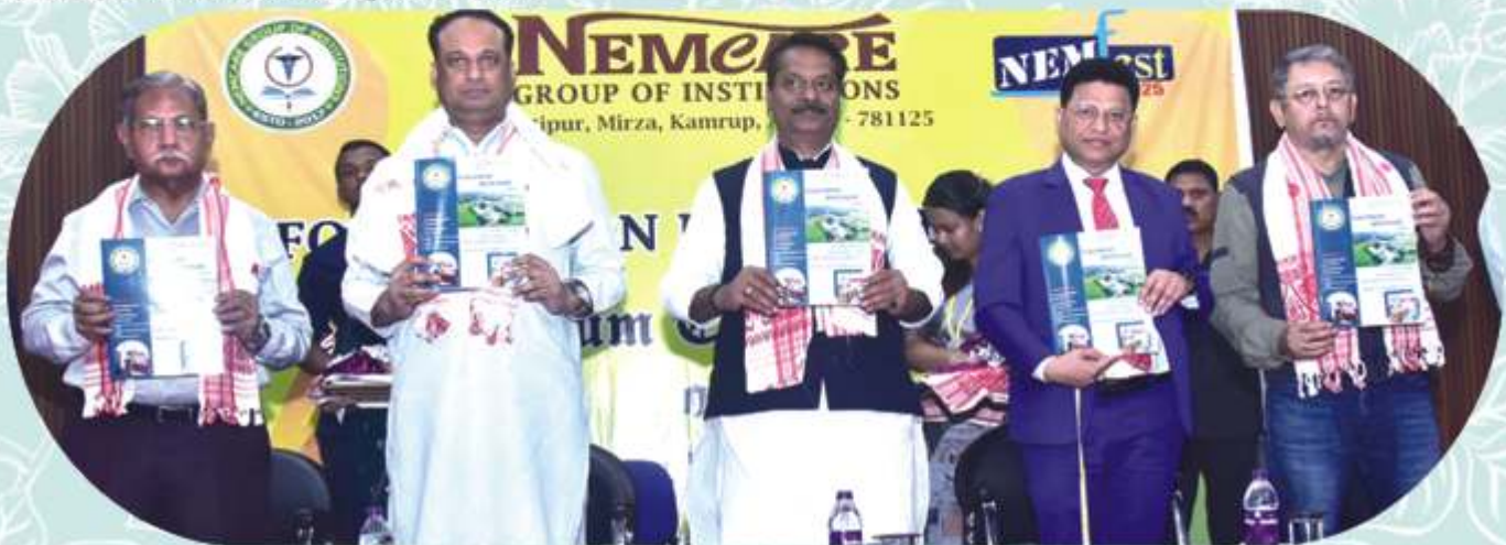
8 th Foundation Day Celebration on 11 th March, 2025 at NEMCARE Group of Institutions