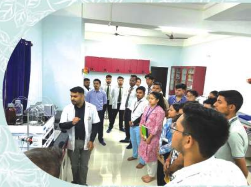
Two day Hands-on training from chemical to animal