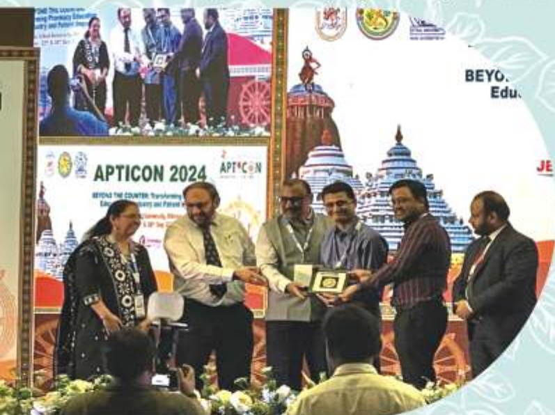
NEMCARE GROUP OF INSTITUTIONS awarded BEST INSTITUTION AWARD at 27th Annual National Convention of APTICON held at Utkal University, Odisha on 27 th & 28 th September, 2024.