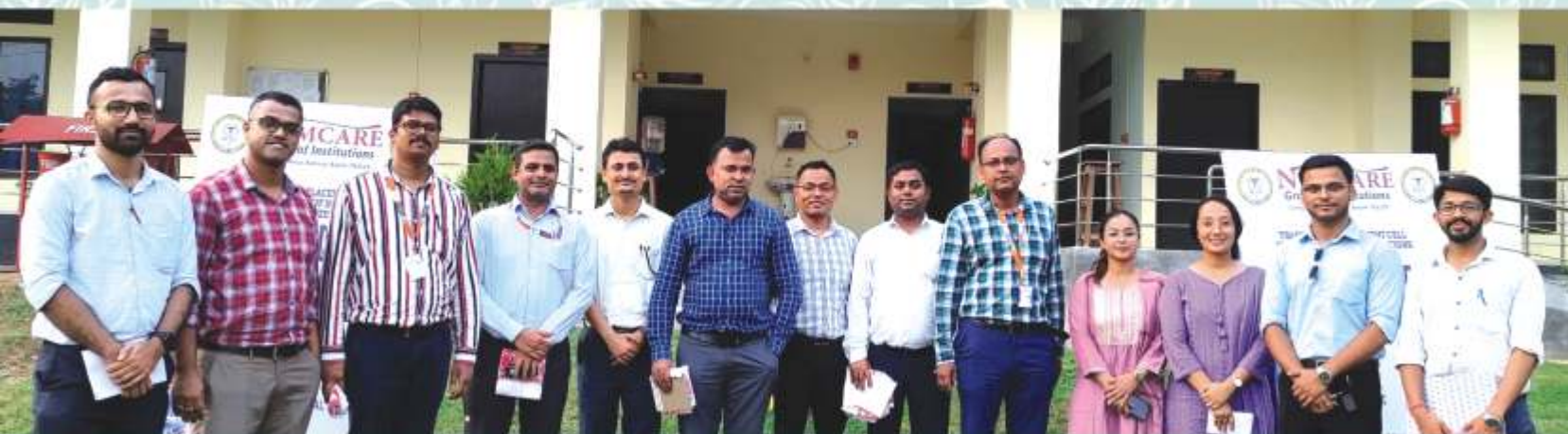
The Training and Placement Cell, NEMCARE Group of Institutions on 8 th June 2024 organized Successful Campus Recruitment Drive in Association with Sun Pharma and CHEMEX Global