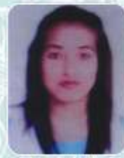
Munmi Kalita Nemcare Hospital, Guwahati (Emergency)