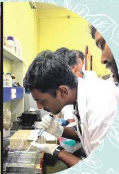
B.Sc. Biotechnology 3 rd Semester students performed Hands-on Training Programme in Basic Molecular Tools Organized at Dept. of Biotechnology, Gauhati University.