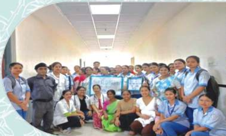
Group activities on world patient Safety at NMCH