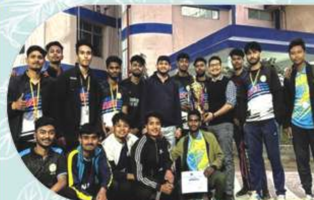
RUNNER UP KBM Cricket Tournament, 2025