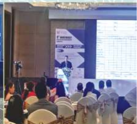
Faculty members and students from the Master's in Hospital Administration program, NEMCARE Group of Institutions participated in the 1st Northeast Healthcare Management Conclave 2024, organized by The Association of Healthcare Providers India (AHPI) - North East Chapters I & II, at the Radisson Blu Hotel in Guwahati. Under the theme "Understanding Healthcare: Challenges & Opportunities," the event, held on September 21, 2024,