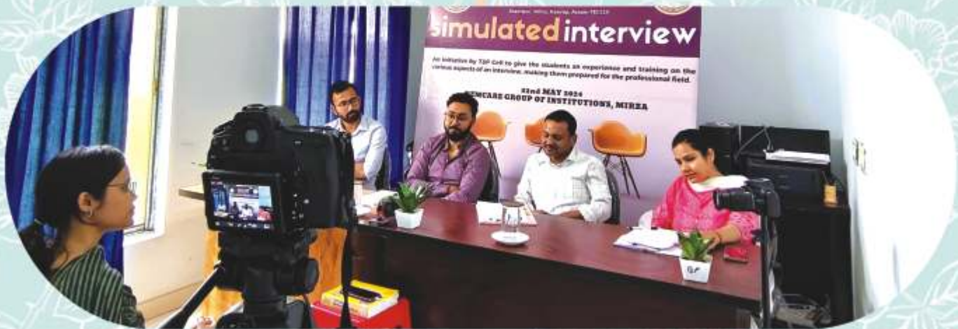
On 22 nd May 2024, The Training & Placement (T&P), NGI conducted a "Simulated Interview" as a part of the grooming sessions