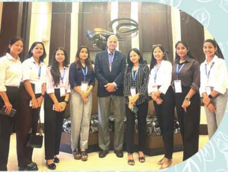
Participation of Masters in Hospital Administration Students in the 1st Northeast Healthcare Management Conclave 2024 at the Radisson Blu Hotel in Guwahati, organized by The Association of Healthcare Providers India (AHPI) - North East Chapters I & II.