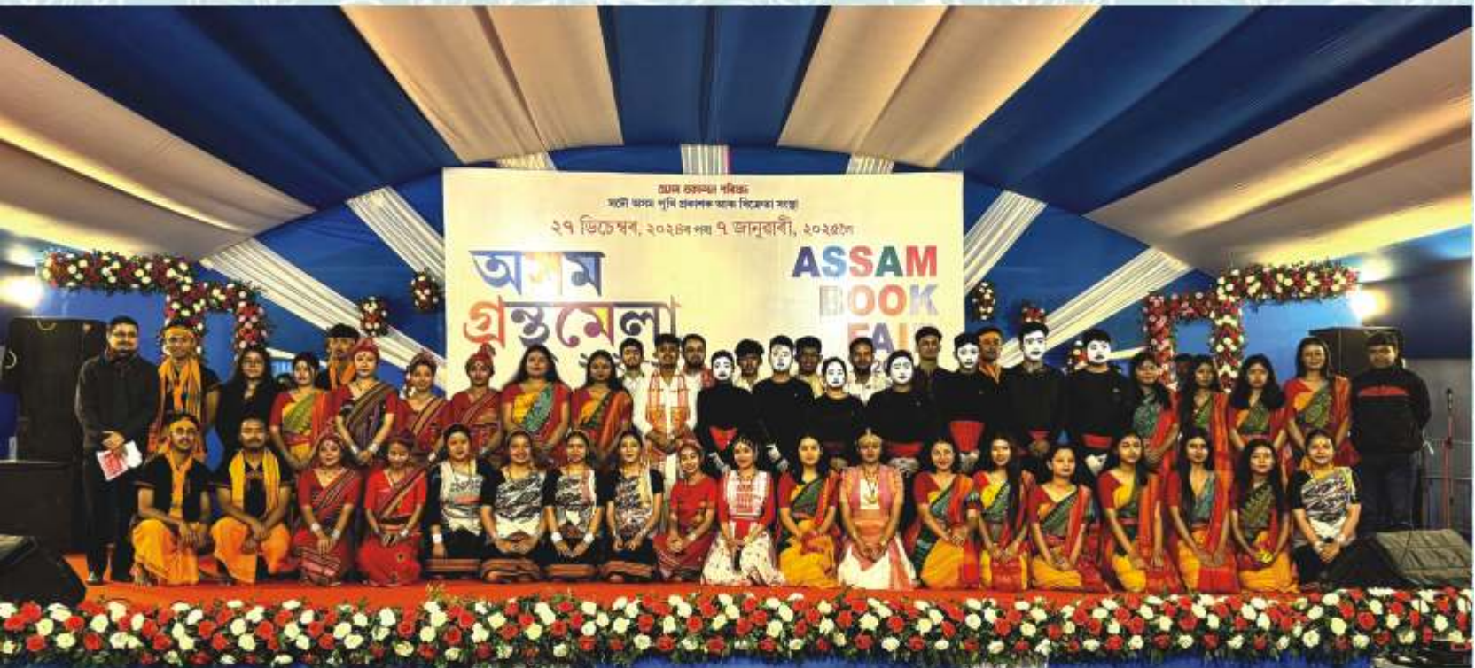
Cultural team of NGI win 4th prize at Assam Book Fair, 2024-25 organised at Khanapra, Guwahati