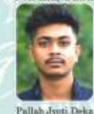
Pallab Jyoti Deka Morigaon Civil Hospital