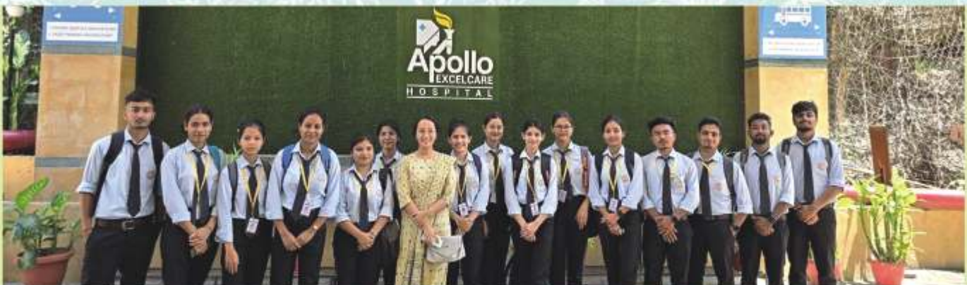
Educational field trip/ Training visit by the students of Masters in Hospital Administration 3 rd Semester at Apollo Excelcare Hospital, Guwahati.