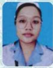
Vanlalhlui Nemcare Hospital, Guwahati (Ward)