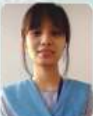
Visedene Nemcare Hospital, Guwahati (MICU)