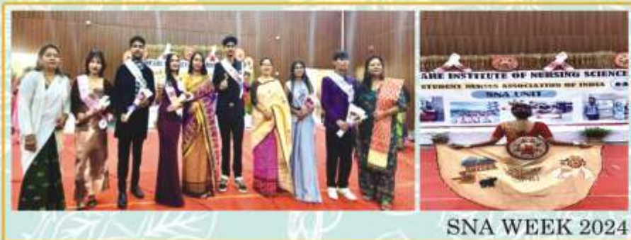
SNA WEEK 2024