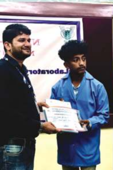
B.Sc. Biotechnology 3 rd Semester students performed Hands-on Training Programme in laboratory techniques for genome editing workflow in animals organized by ICAR-National Research Centre on Pig.