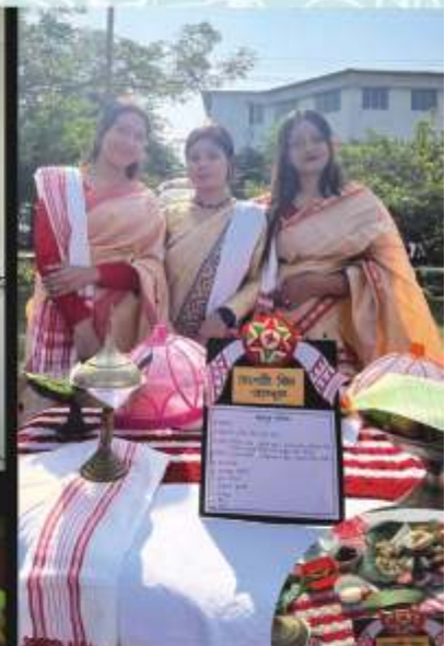
On the Occasion of Pre Bihu Celebration at NGI, Students from 1 st semester Department of Food Nutrition and Dietetics got 1 st prize in Heaven Harvest competition