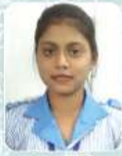
Swapna Deka Nemcare Hospital, Guwahati (Ward)