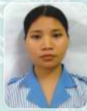
Yophika Thabab Nemcare Hospital, Guwahati (Burn unit)