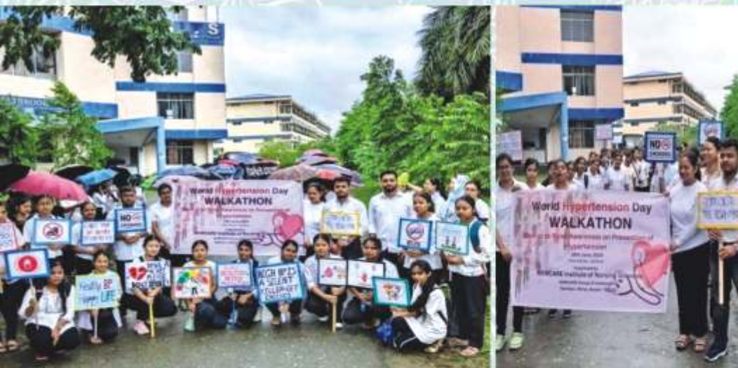
WORLD HYPERTENSION DAY WALKATHON 28TH MAY 2024