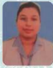
Bhupali Saharia Nemcare Hospital, Guwahati (Cath Lab)