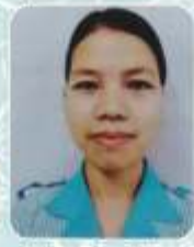
Rikmenlang Thongni Nemcare Hospital, Guwahati (OT)