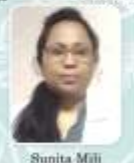
Sunita Mili Supercare Hospital Shillong