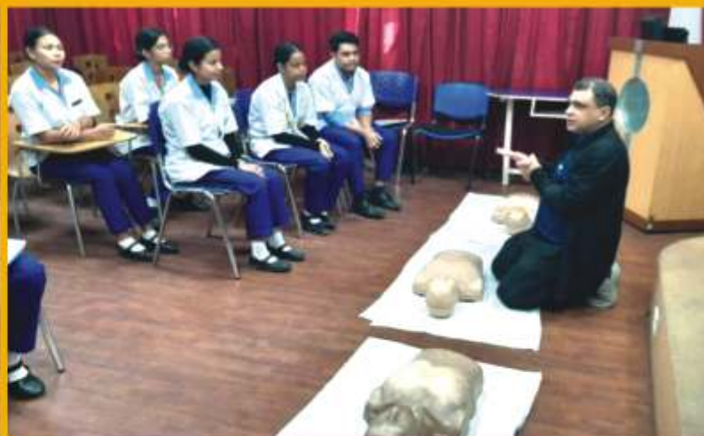
ACLS & BLS Training