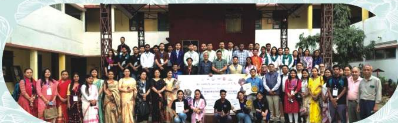
12 students attended the International Conference on "Recent Trends on Natural and Applied Sciences (ICNAS 2025) organised by Guwahati College Teacher's Unit (March 21-22, 2025).