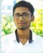
Vishal Parasar Cancer Care Hospital, TATA 1mg Hospital Pharmacist